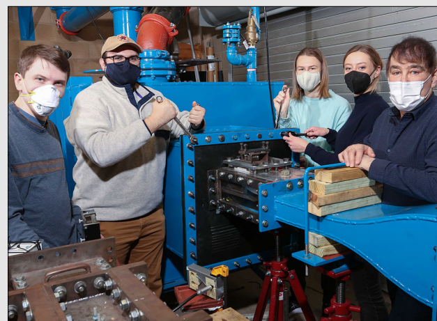
Supersonic Wind Tunnel Laboratory