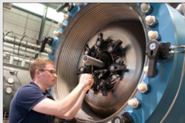
Charger Advanced Propulsion and Power Laboratory