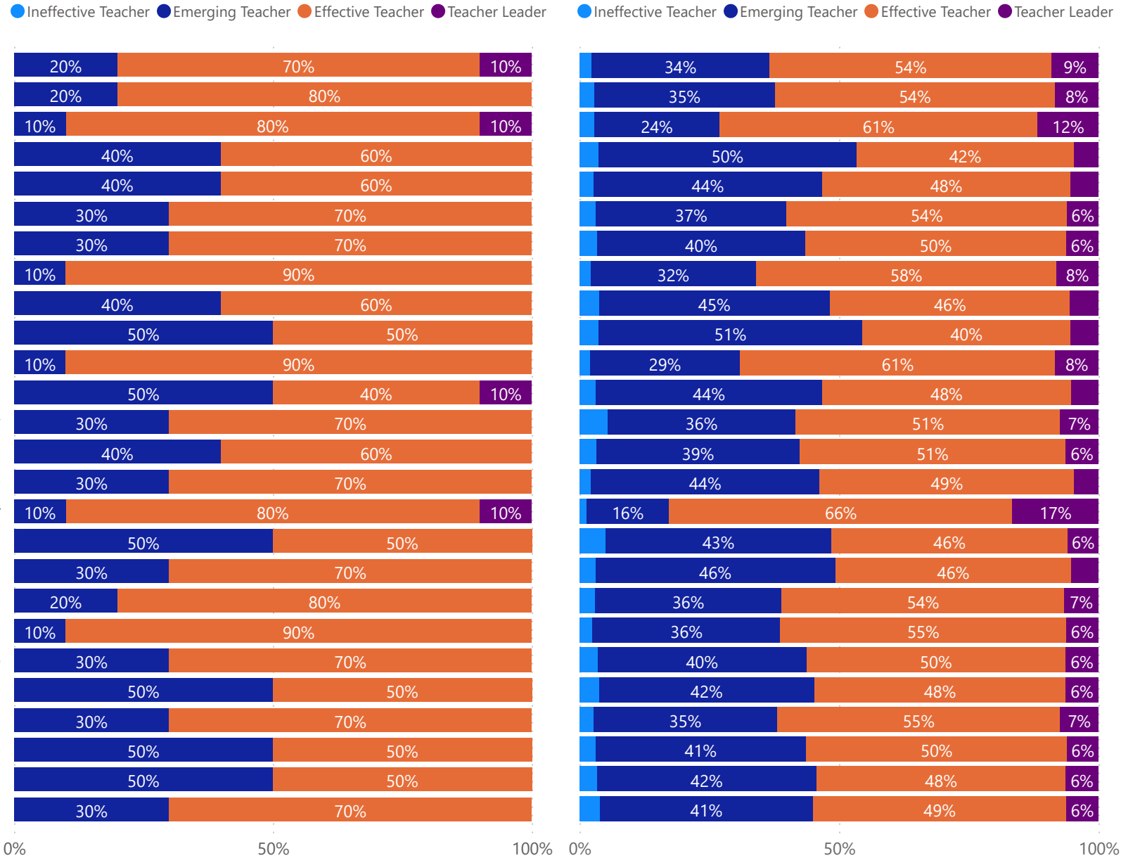
Alabama State Wide 901 respondents